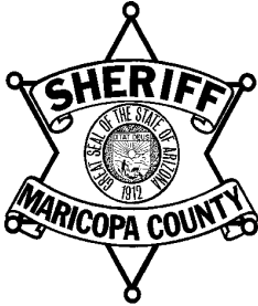
Joseph M. Arpaio, Sheriff